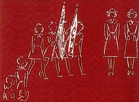
“Color guard, retire the colors.”