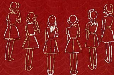
“Color guard, dismissed.”