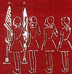
“Girl Scouts, attention.”

You can show your respect for the flag in a flag ceremony. You might say the Pledge of Allegiance or sing a song like “America the Beautiful.” Sometimes these special commands are used.