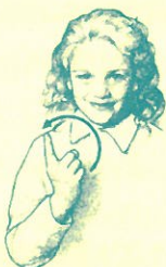
at all times